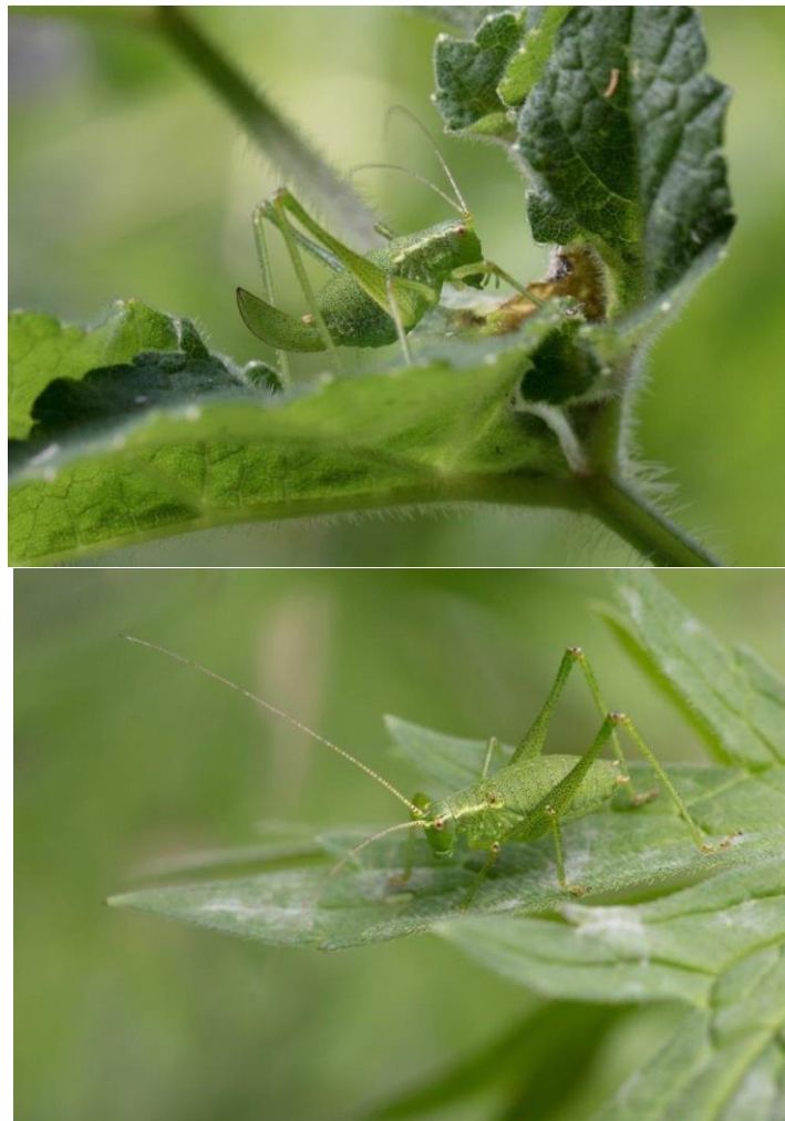
taken at Pocket Park, Langham Female (top) Male (bottom) Speckled Bush-cricket

One female, on 19 July, and a male and female on 20 July were in the 'Pocket Park' in Langham. New site, SK848112.