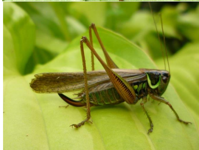
Male (top) Female (bottom) Roesel's Bush-cricket