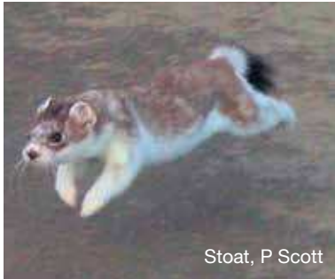
Stoat

It's strange how mammal records seem to come in lumps! This time we have two lovely reports of Stoats in ermine, a sign that the winter has been fairly cold for a few months. Stoats change colour according to the temperature and day length, in some cases turning completely white, and others only partly so. One stoat in ermine was seen at Langham crossing a track; and another at Tickencote was hunting along the verge, and slipped into the hedgerow on our approach. Other stoats seen, though not in ermine, were at Pilton, and near Gibbet's gorse at RWNR. The reason why some stoats change colour and others do not is not clearly explained, though it may be to do with genetics and origins. Animals which have colonised from the north will carry genes enabling colour change, as a result of adaptive camouflage encouraging success in the north. Other animals originating further south will not have needed this benefit, so do not carry the same genes. There have been no reports of Weasels during January and February.