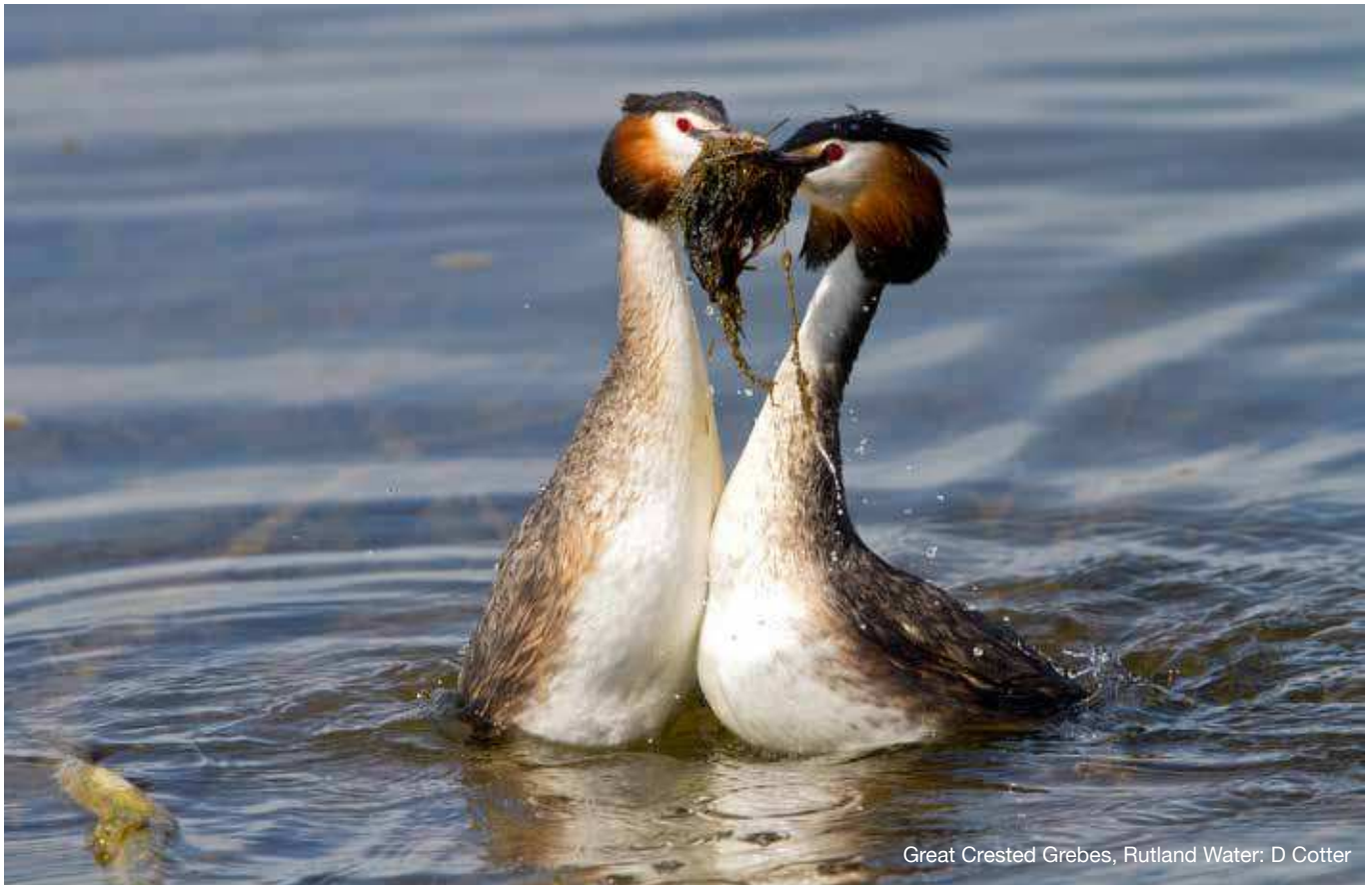
Great Crested Grebes, Rutland Water: D Cotter