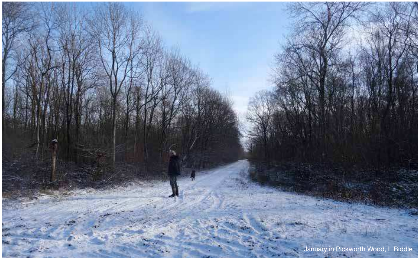
January in Pickworth Wood, L Biddle