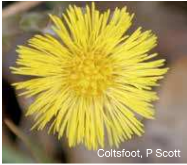
Coltsfoot