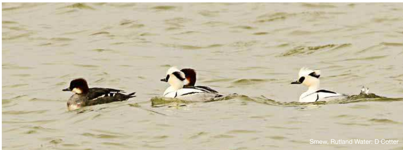
Smew, Rutland Water: D Cotter