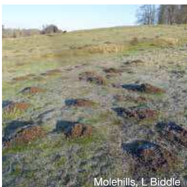
Molehills, L Biddle

The increasing number of otter reports contrasts with a falling off of Foxes . We have one report only of a Fox, seen slinking along the hedgerow near Mount's Lodge Farm on the Pickworth road, and two reports of evidence, scats found at