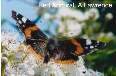
Red Admiral