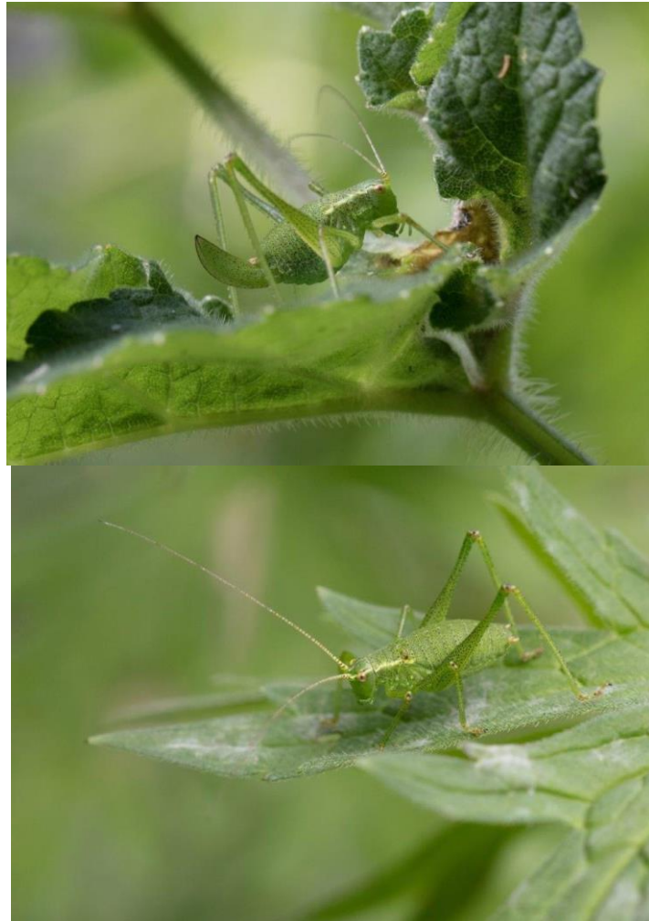
taken at Pocket Park, Langham Female (top) Male (bottom) Speckled Bush-cricket

One female, on 19 July, and a male and female on 20 July were in the 'Pocket Park' in Langham. New site, SK848112.