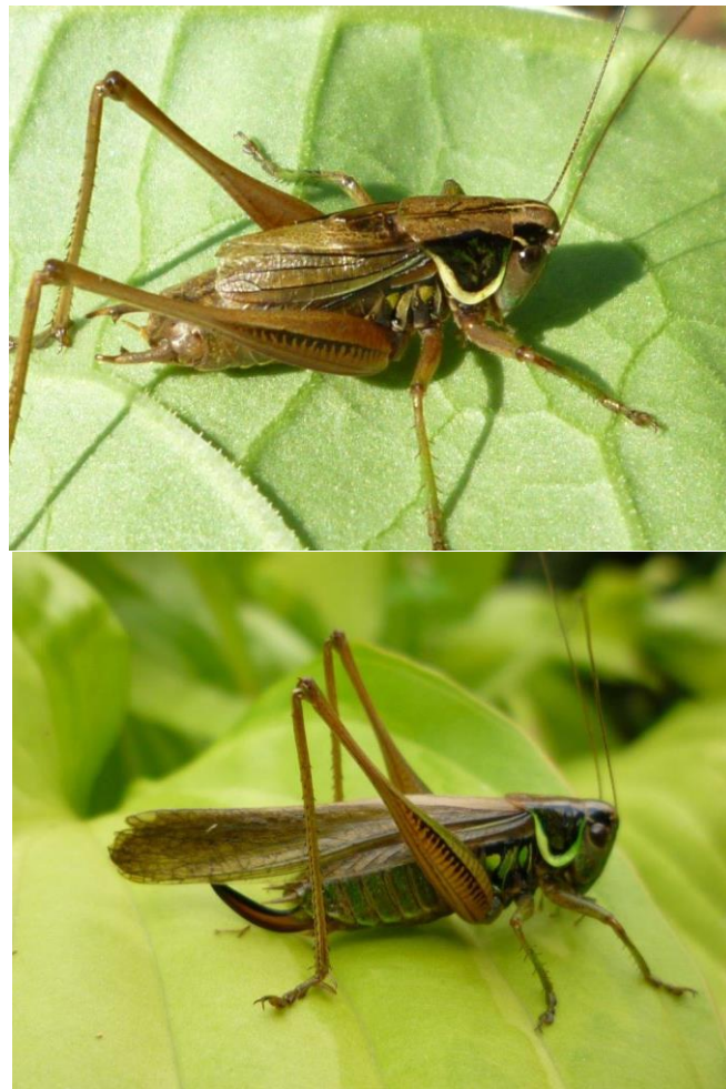
Male (top) Female (bottom) Roesel's Bush-cricket

Large colonies were discovered in two areas of Luffenham Heath Golf Club, on 10 July and 22 August. New sites: SK962029 and SK960026.