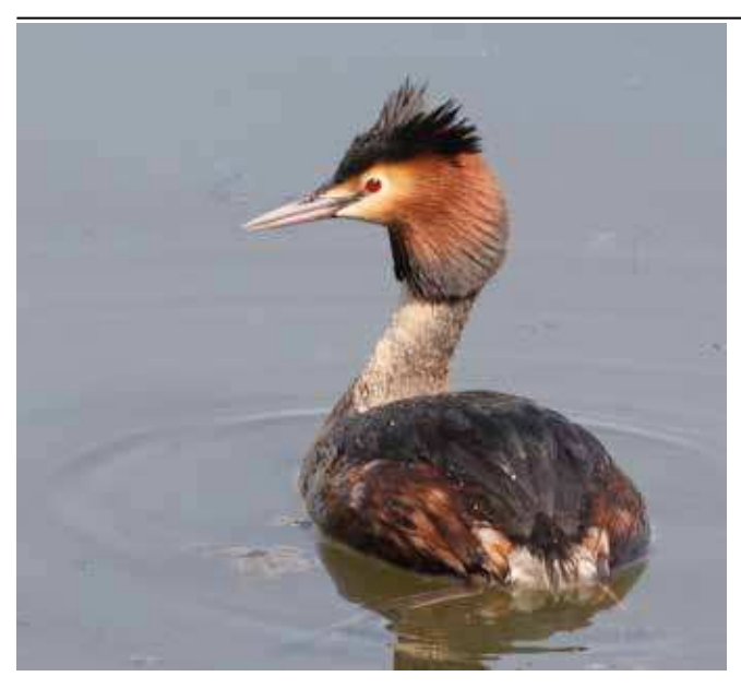
Great Crested Grebe, Peter Scott