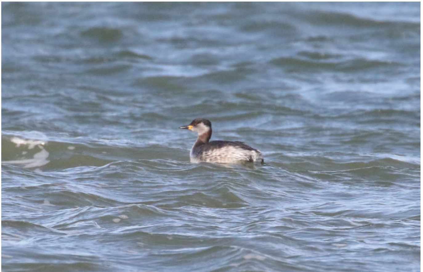
Red necked grebe, Lyndon.