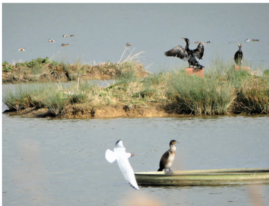
Egleton.