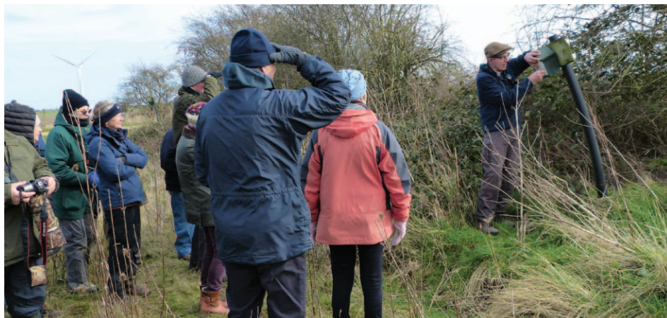
Vine house farm visit.

We had a good view of a barn owl sheltering in bushes in the lee of a copse until he/she flew away along the bank. N.W. remarked that owls are struggling to find prey at the moment, because the strong winds mean they are unable to hear their prey or fly sufficiently stealthily to hunt easily. As we drove along a dyke, a pair of goosander took off, over and around our heads and several cormorant and mallard were also seen here. At a larger area of water, numerous wigeon, mallard and shoveller paddled or sheltered from the wind, while a few greylag geese waddled about on the shoreline. NW took us to look at an area of oilseed radish. Direct drilled after a crop of winter wheat, it is a cover crop, preventing weed growth during the autumn and winter, also providing extra nitrogen when it is desiccated in the spring, when cereal is direct drilled into the seedbed. The process means there is no need to cultivate the soil, allowing invertebrates to thrive, which in turn gives food for birds. NW said that last month there were over a thousand birds on the area, and last year, after the oilseed radish, 45pairs of lapwing had nested on the field! At least one farmer has the interests of wildlife at heart!