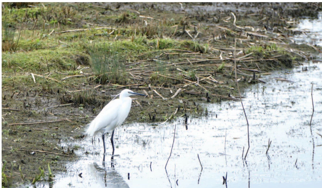
Little egret. Egleton.