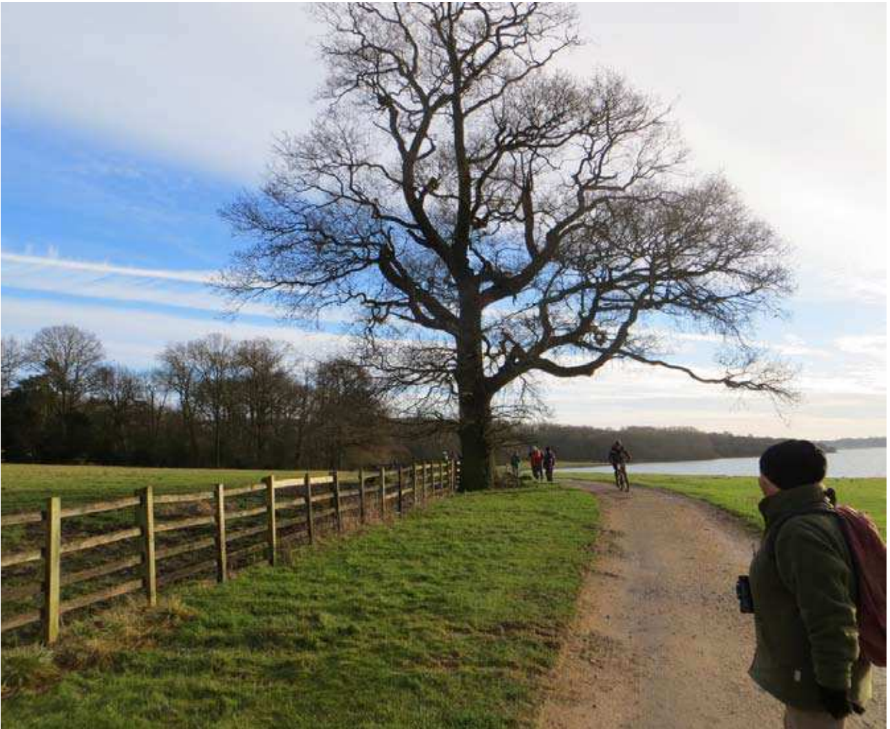
Another photograph from the first RNHS meeting of the year at Hambleton Peninsula.