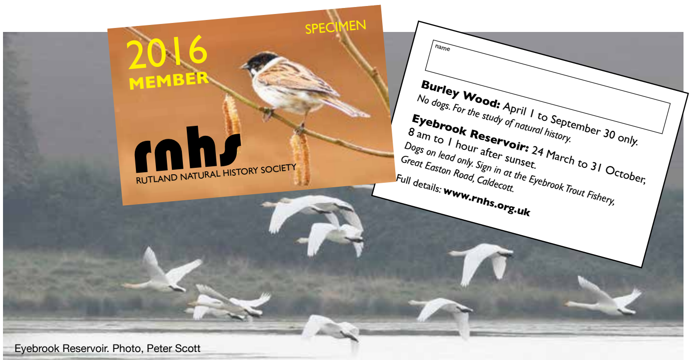
Eyebrook Reservoir.

Your 2016 membership card comes with this Fieldfare , or will be posted to you. The website has full details about what this entitles you to. Please note that the owners have recently withdrawn winter access to the Eyebrook Reservoir.