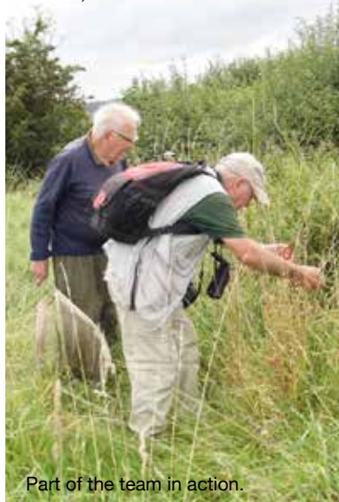
Part of the team in action.