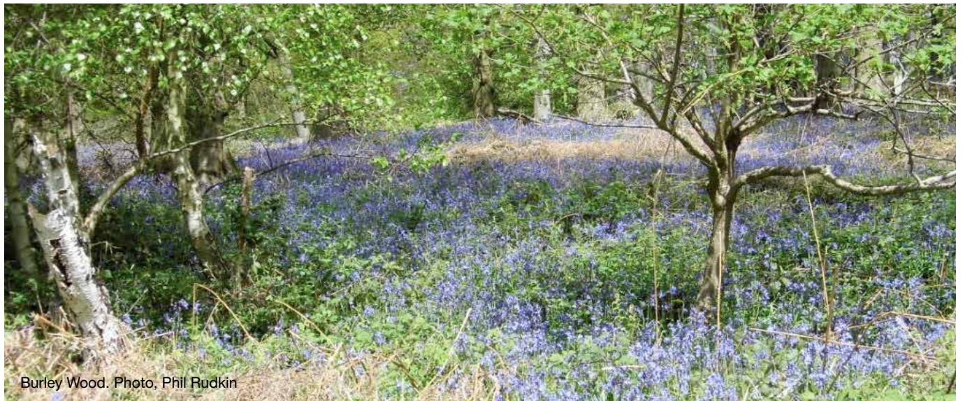
Burley Wood.

Your 2016 membership card comes with this Fieldfare , or will be posted to you. The website has full details about what this entitles you to. Please note that the owners have recently withdrawn winter access to the Eyebrook Reservoir.