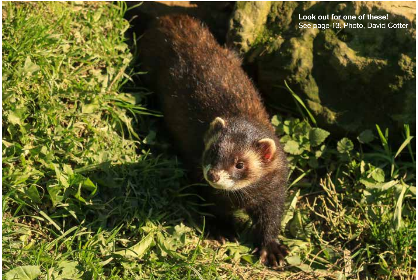
Look out for one of these! See page 13.