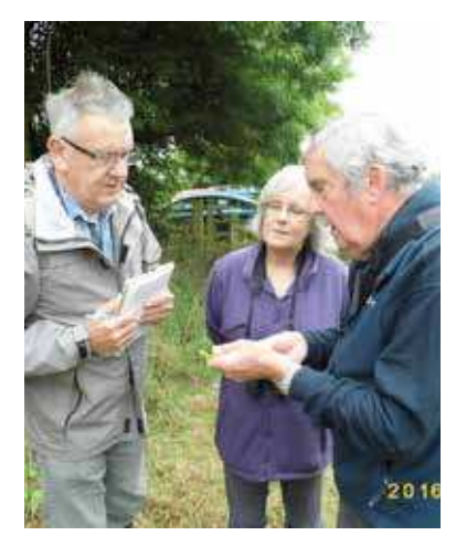
RNHS Field trip to Prior's Coppice to look for plant galls with members of BPGS, September 6, P Rudkin.