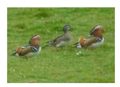
Mandarin Ducks, Terry Mitcham

Some excellent birds in these months concluded a successful year for local bird watchers. As ever, Rutland Water was to the fore with the county's first Surf Scoter and a Green-winged Teal in support. Other scarce wildfowl included Long-tailed Duck and Common Scoter along with all five grebes. Great White Egrets increased and two Bitterns were seen at Egleton. Away from Rutland Water, a Great Grey Shrike by Oakham Canal was well received and a Glaucous Gull roosted at Eyebrook. So far, few Waxwings have stayed for long but there is still time for them to plunder any remaining berries