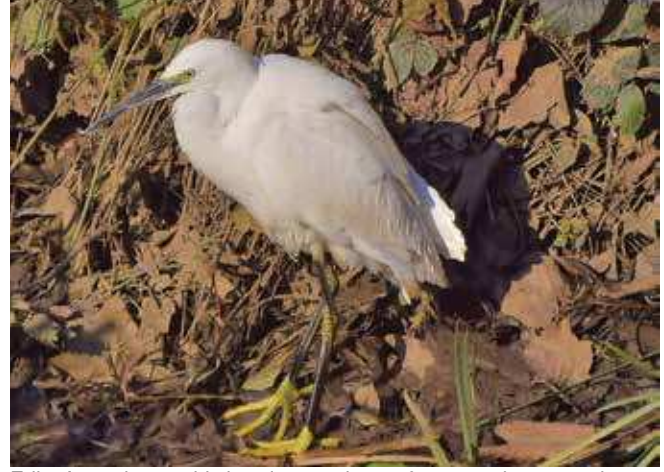
Editor's apology – this handsome photo of an egret has turned up, but I've lost the connection to the sender. Let me know, and I'll acknowledge you next issue!